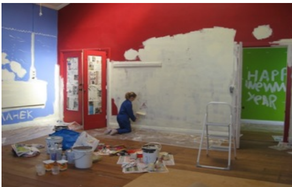
From this to this