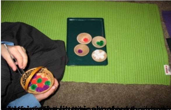
Painting the little things has been a busy beginning to the new year with the children working hard to help us create a new Atrium