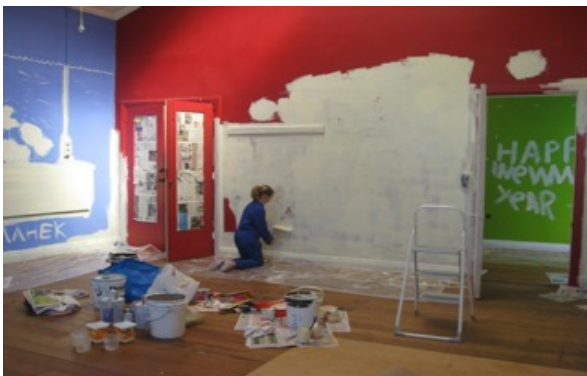
From this to this