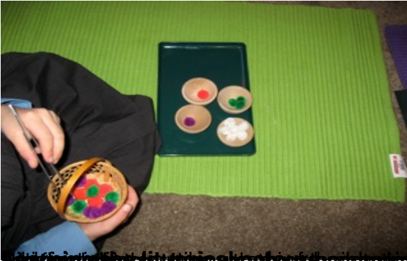
Painting the little things has been a big learning but also a big challenge with the children who are fully New Atrium