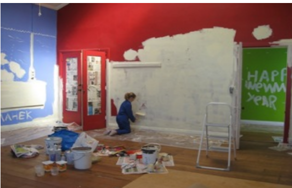
From this to this