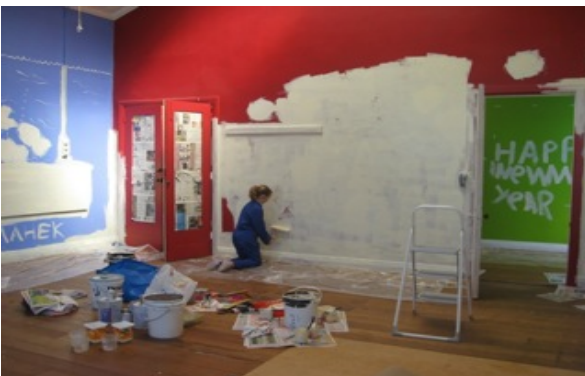
From this to this